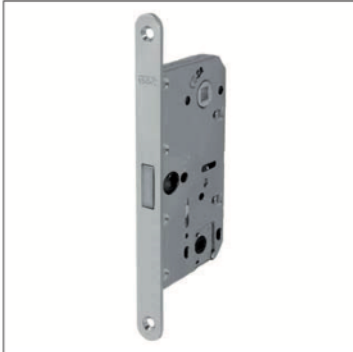
INS-ML8 Satin Chrome Mortice Lock/Bathroom Lock with 8mm Spindle