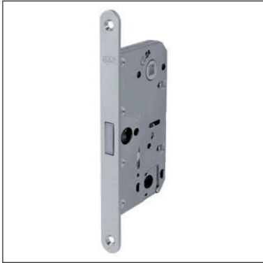
INS-ML8 Satin Chrome Mortice Lock/Bathroom Lock with 8mm Spindle